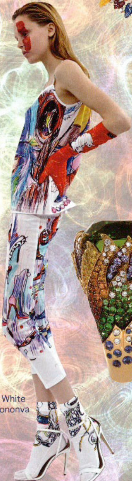
Outfit: White by Parfononva