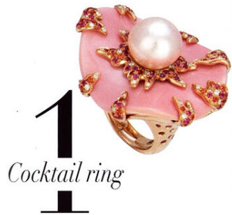
1 Cocktail ring

Atollo conch precious ring, ALESSIO BOSCHI