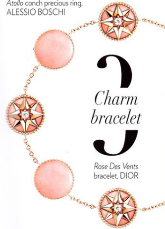
2 Charm bracelet

Atollo conch precious ring, ALESSIO BOSCHI