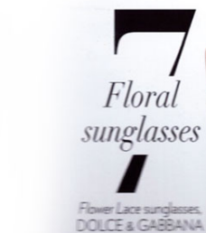
7 Floral sunglasses