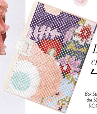
4 Deco clutch

Box Strass clutch from the SS17 Collection, ROGER VIVIER