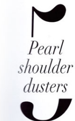
3 Pearl shoulder dusters