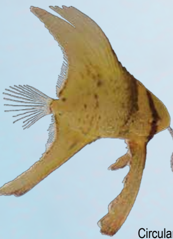
Circular Spade Fish