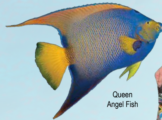
Queen Angel Fish