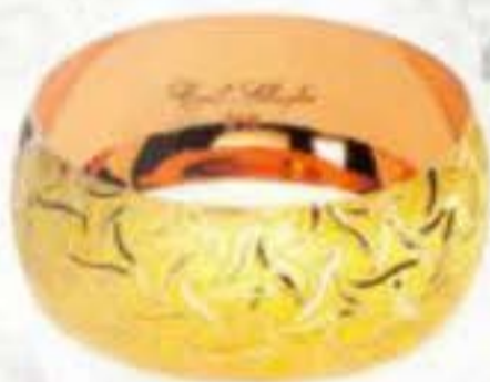
Carl Schaefer Jewellery