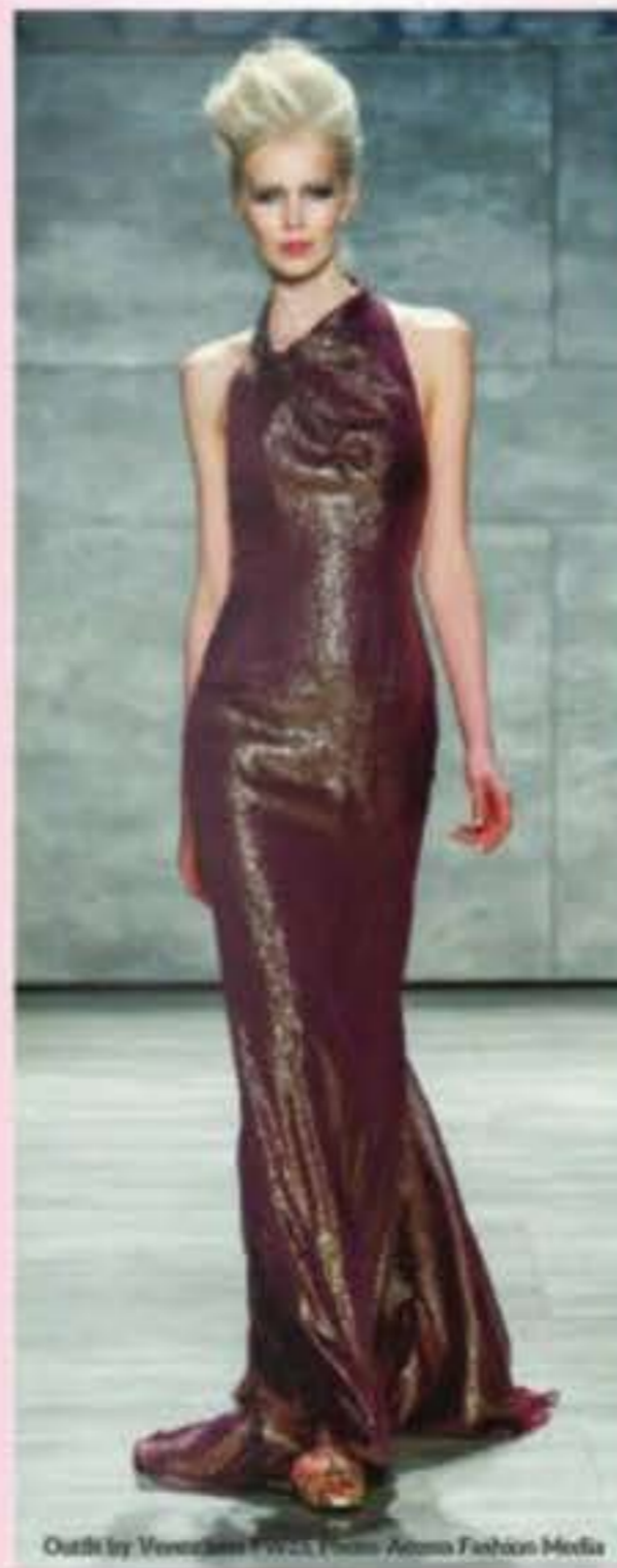
Outfit by Versace Fall FW15