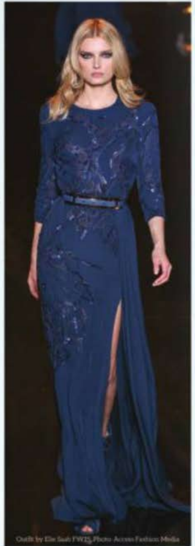
Outfit by Elie Saab FW25, Photo: Access Fashion Media