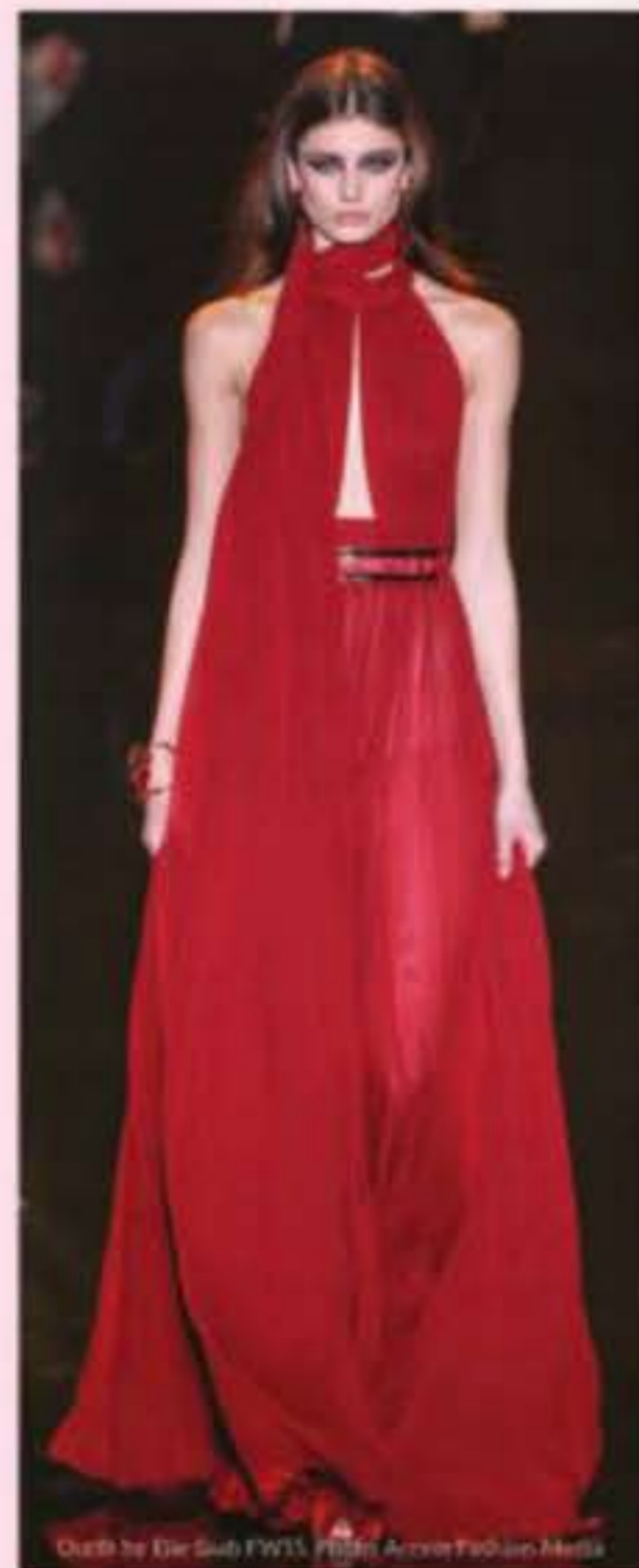
Outfit by Dior Fall FW15