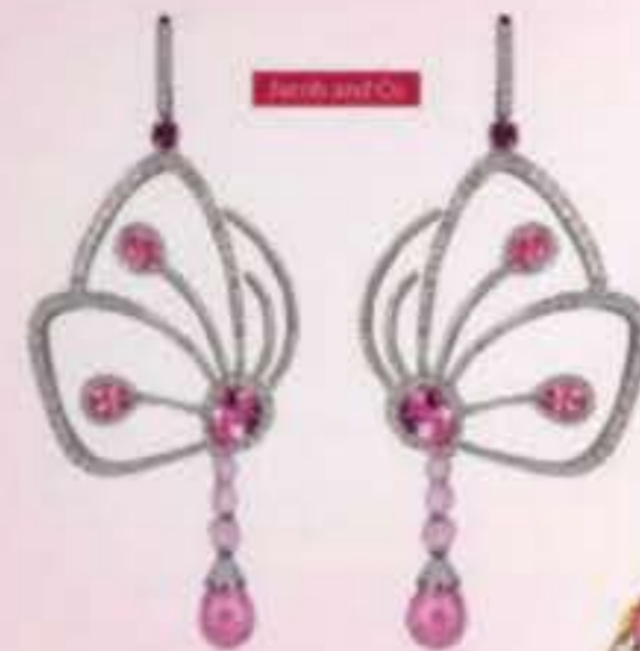
Jarrah and Co

A symbol of femininity, pink is always a summer favourite. From delicate opals to sparkling sapphires, pretty in pink never goes out of fashion. With its compelling beauty, purple has been traditionally associated with power and royal status. No wonder it's ruling the fashion runways as well as our hearts.