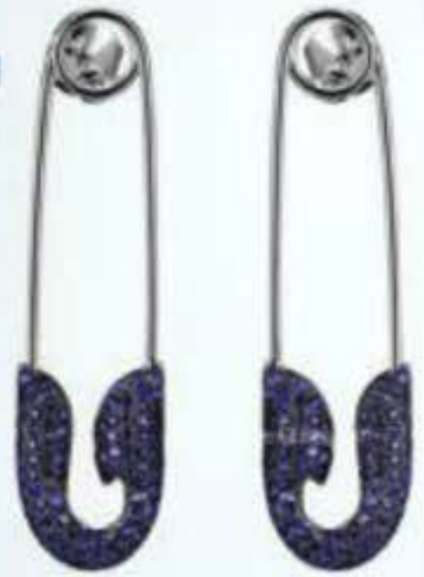
Jacob and Co.