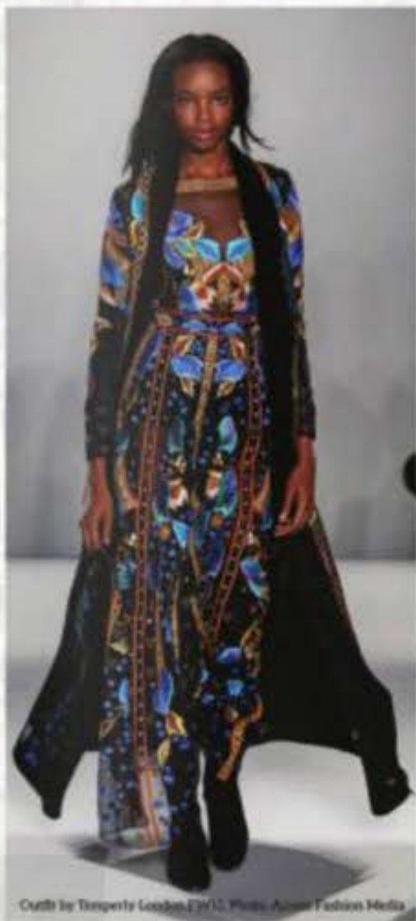
Outfit by Temperley London, E/W 12. Photo: Anne Fashion Media