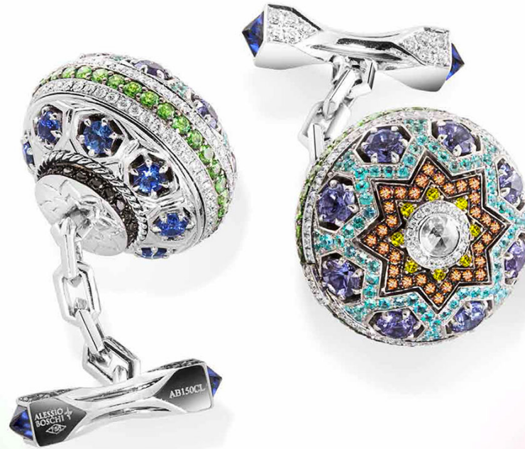
'Qajar Pride Cufflinks' in 18K white gold, with white, yellow and black diamonds, blue, orange and purple sapphires, and Paraiba tourmalines.