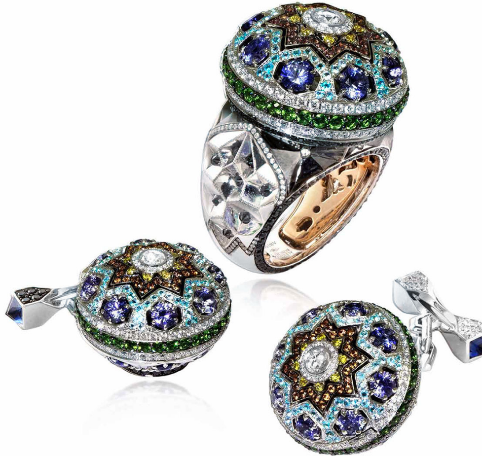
'Qajar Pride Cufflinks and Ring' in 18K white gold, with white, yellow and black diamonds, rose-cut white diamonds, blue, orange and purple sapphires, and Paraiba tourmalines.